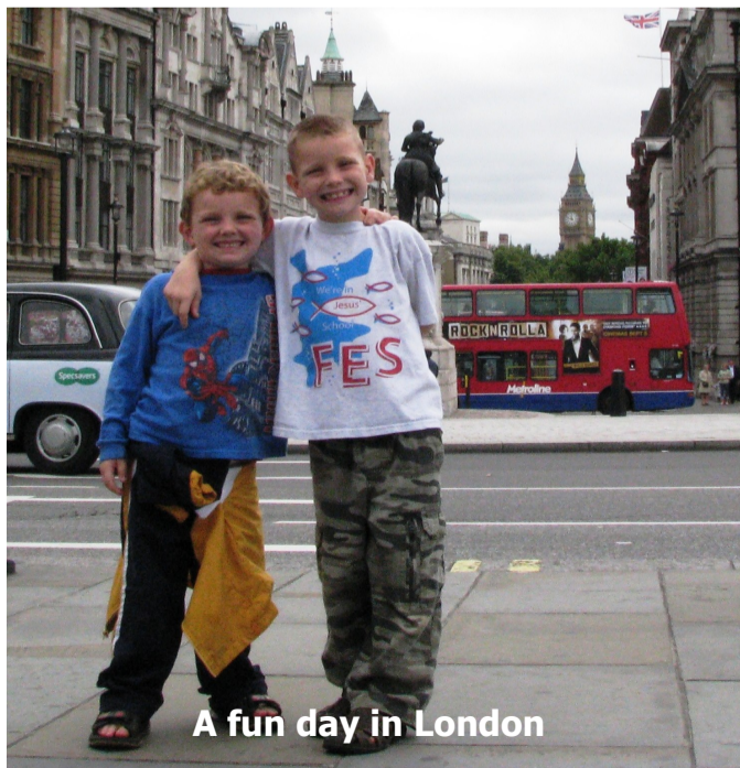
A fun day in London

From Florida, to Iowa, to Texas, wherever we've gone, we've received outstanding hospitality, delicious food, and the love and warmth of a Christian family. We want to say a huge "Thank You" to everyone that has lodged us, fed us, allowed to come and share. This trip